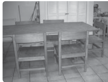
Newly Purchased Day Center Furniture